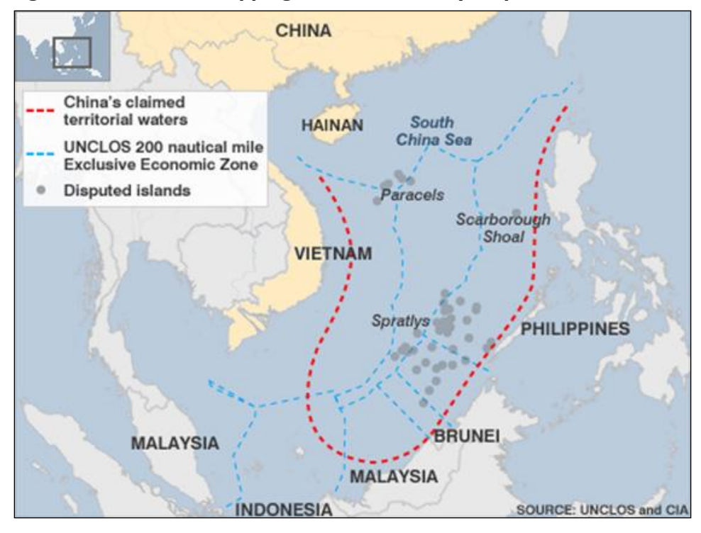
Figure E-2. EEZs Overlapping Zone Enclosed by Map of Nine-Dash Line