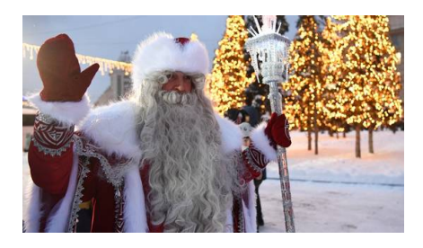
In post-Soviet Russia, New Year's remains a bigger holiday than

Lenin's Yugoslavia: How a plan to create a 'Soviet Switzerland' was shot down by Stalin and other locals FEATURE