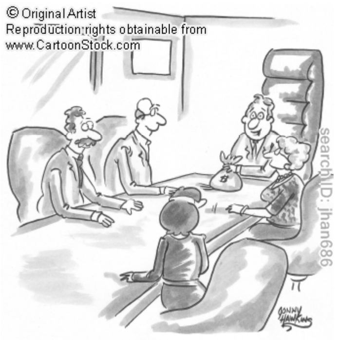
"Today is financial Arbor Day. We're going to find some worthwhile charity and plant a money tree."