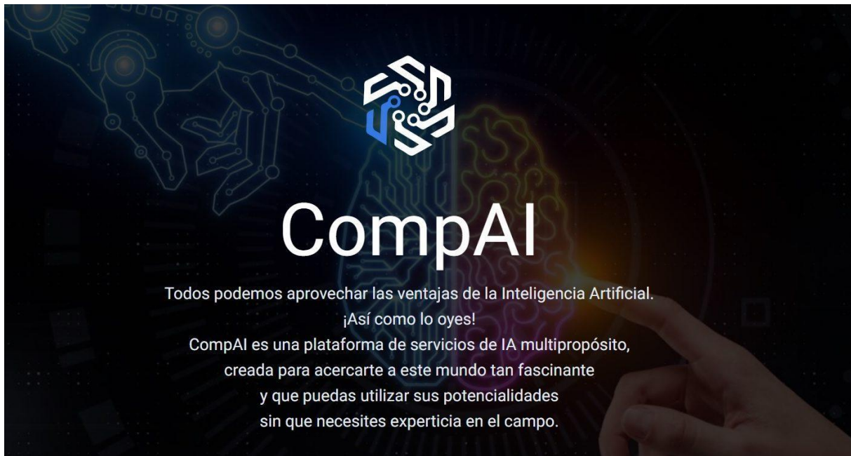
The website of the Cuban AI "CompAI"

The topic of artificial intelligence is on everyone's lips right now. Since its release in November 2022, the software "ChatGPT" has amazed the media and interested public with its capabilities. Whether it's poetry, scientific essays or writing complex computer programmes based on natural language input, there hardly seems to be anything left that an AI can't handle.