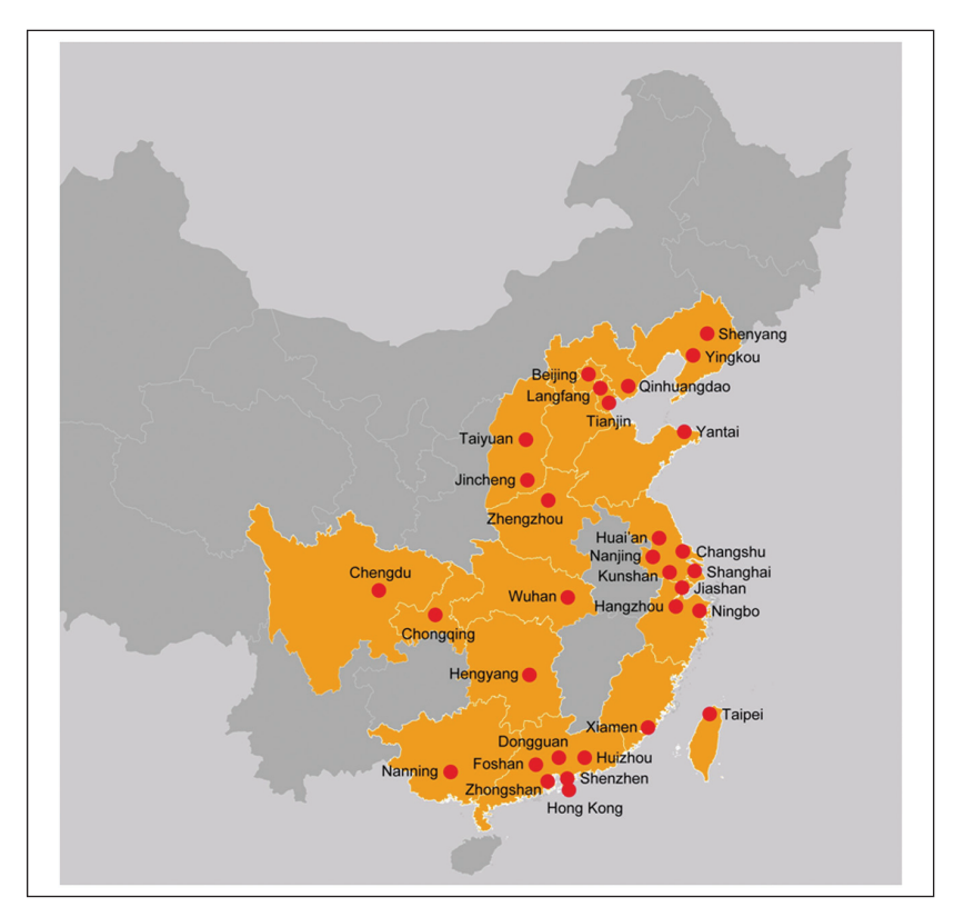
Figure 1. Foxconn production facilities in China, Hong Kong, and Taiwan

Note. Foxconn production sites are located in four main geographic clusters: